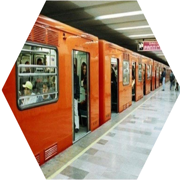
A TRANSPORTE RED DEL METRO